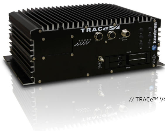
// TRACe™ V40x

When geo-location is needed, a GNSS receiver is installed on TRACe to localize information and data.